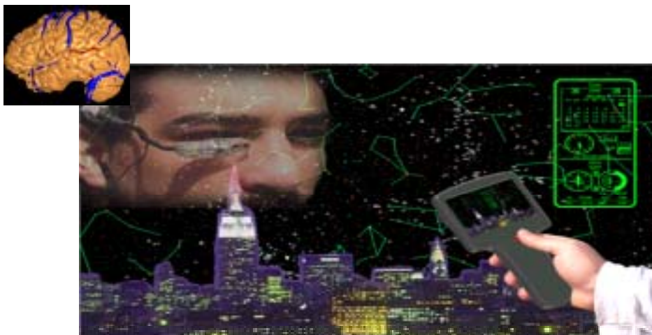
Figure 2. Vision of the world as an interconnected brain with various architectural levels.

Technological convergence could become the framework for human convergence (Ostrum et al. 2002). The twenty-first century could end in world peace, universal prosperity, and evolution to a higher level of compassion and accomplishment. It is hard to find the right metaphor to see a century into the future, but it may be that humanity would become like a single, transcendent nervous system, an interconnected "brain" based in new core pathways of society. If a concrete image like that shown in Figure 2 seems too confining, then perhaps the right way to sense the convergent future is through a pure, uncluttered emotion: hope.