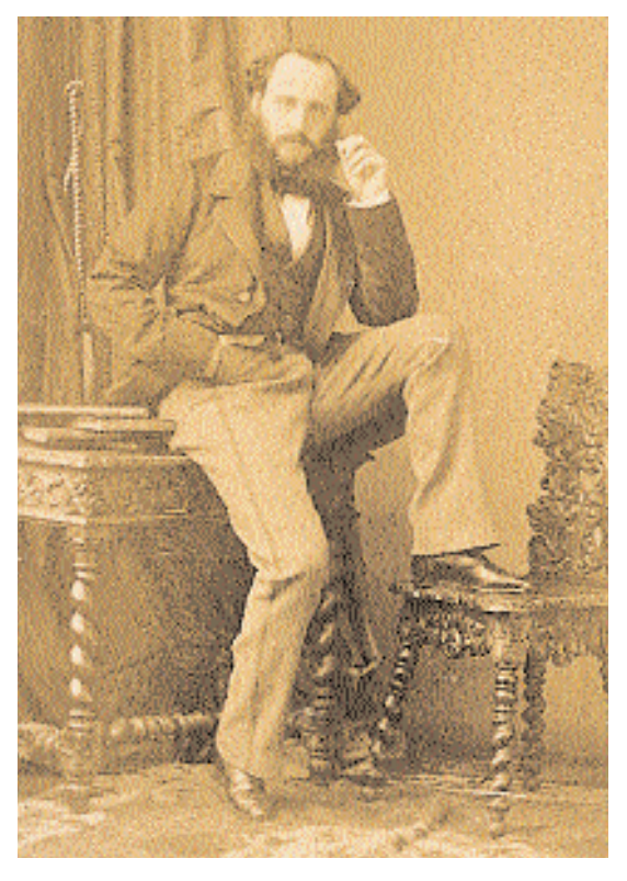
Ignacio Bauer, 1859