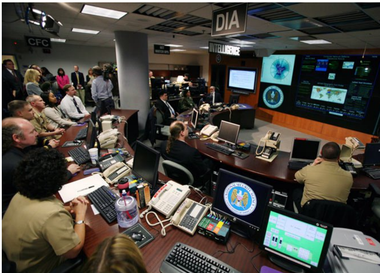
Ever watching and listening: a control room at NSA headquarters.